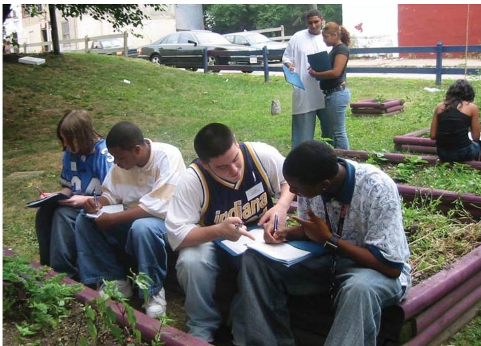
The youth leadership from CBCC worked towards finding productive and peaceful alternatives to violence.

*The Henry J. Kaiser Family Foundation –Latinos and HIV/AIDS Fact Sheet May 2008