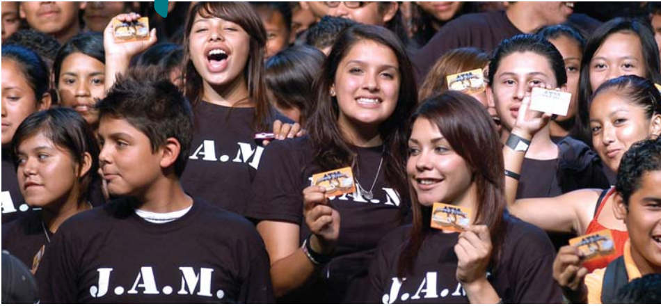
Youth proudly wear their J.A.M. (Join the Abstinence Movement) t-shirts and show their pledge cards at the Tesoros Rally in CA.